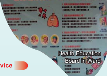
Health Education Board in Ward