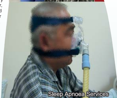
Sleep Apnoea Services