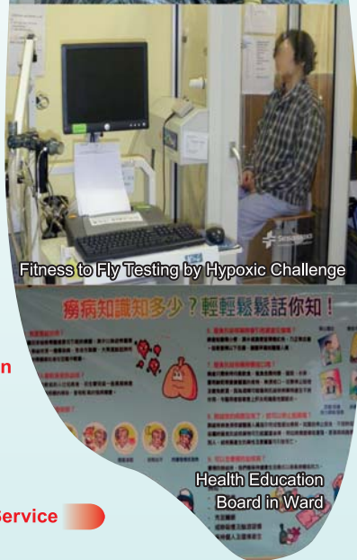
Fitness to Fly Testing by Hypoxic Challenge