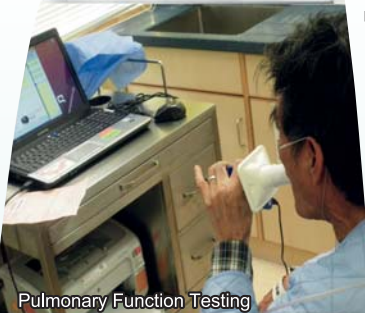
Pulmonary Function Testing