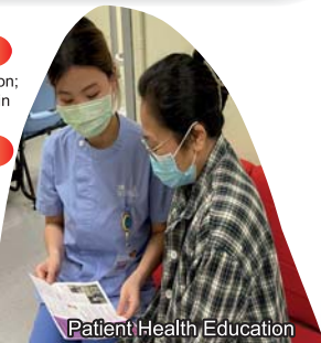
Patient Health Education

In-patient Services include that for Tuberculosis, Chronic Obstructive Pulmonary Disease (COPD), Pneumonia, Lung Cancer, Sleep Apnoea, and Undiagnosed Respiratory Conditions that require further investigation etc. Intensive care equipment, such as mechanical ventilator and monitoring device are also available to serve chronic critically ill patients. Since 2015, Chronic Ventilator Beds have been designated by HA to serve medical in-patients from the Kowloon and NT clusters. The Out-patient Clinics of the Department are located at the Our Lady of Maryknoll Hospital. The Department abides the principle of united medical and nursing care; and upholds the spirit of holistic community care in serving our patients.