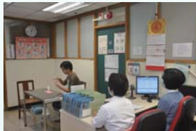
▲ Extension of opening hours to facilitate the implementation of DOT