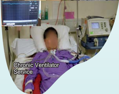
Chronic Ventilator Service