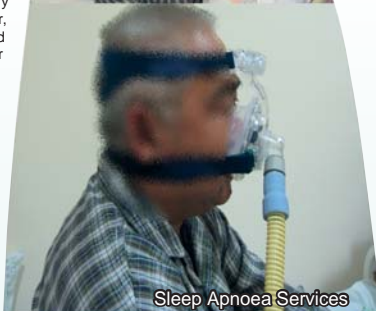
Sleep Apnoea Services