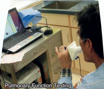
Pulmonary Function Testing