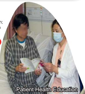
Patient Health Education

In-patient Services include that for Tuberculosis, Chronic Obstructive Pulmonary Disease (COPD), Pneumonia, Lung Cancer, Sleep Apnoea, and Undiagnosed Respiratory Conditions that require further investigation etc. Intensive care equipment, such as mechanical ventilator and monitoring device are also available to serve chronic critically ill patients. Since 2015, Chronic Ventilator Beds have been designated by HA to serve medical in-patients from the Kowloon and NT clusters. The Out-patient Clinics of the Department are located at the Our Lady of Maryknoll Hospital. The Department abides the principle of united medical and nursing care; and upholds the spirit of holistic community care in serving our patients.