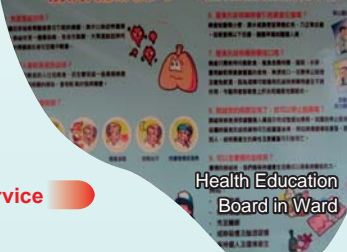
Health Education Board in Ward