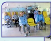
▲ Education health talk