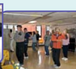
▲ Pulmonary rehabilitation day centre