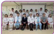
▲ Respiratory medical staff (doctors, nurses, allied health professionals)