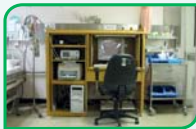
▲ Sleep test